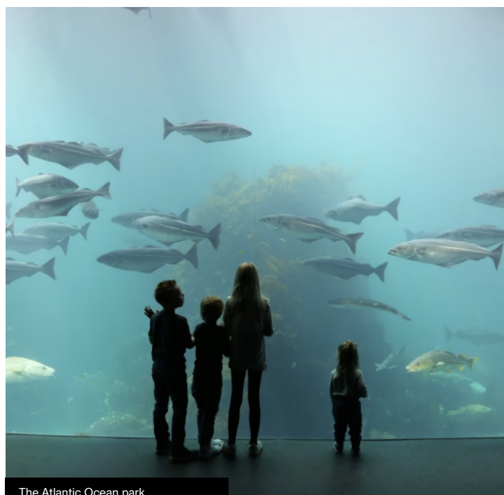
The Atlantic Ocean park