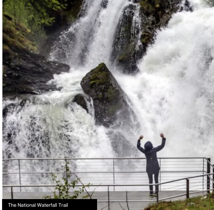
The National Waterfall Trail