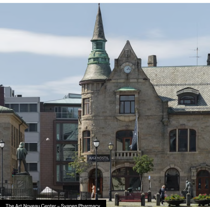
The Art Nouveau Center – Svanen Pharmacy