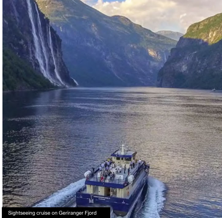
Sightseeing cruise on Geiranger Fjord