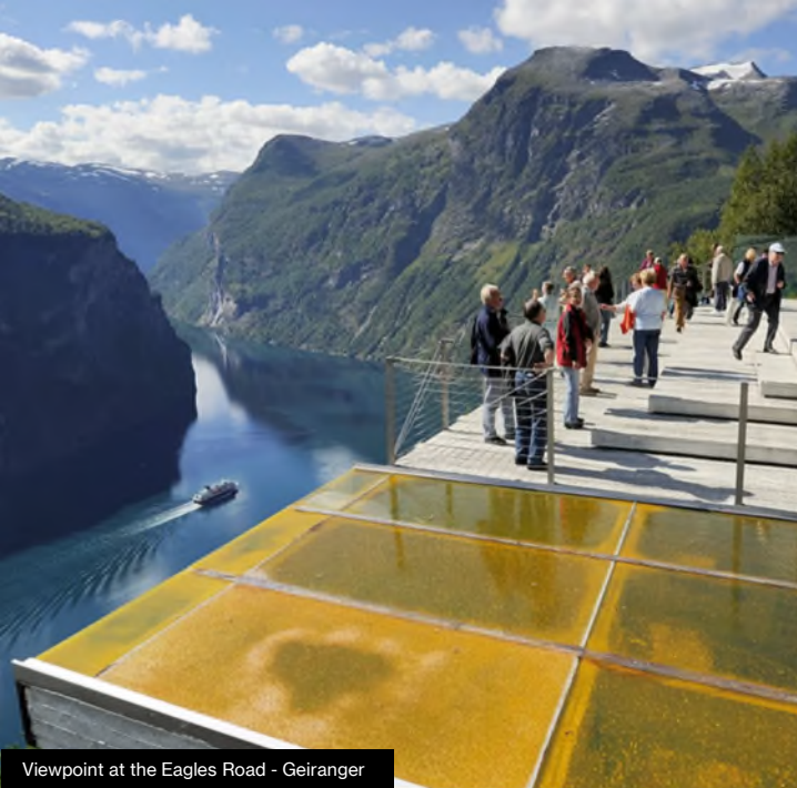
Viewpoint at the Eagles Road - Geiranger