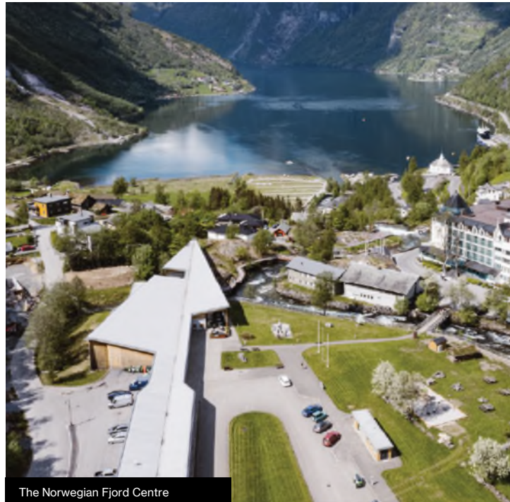
The Norwegian Fjord Centre