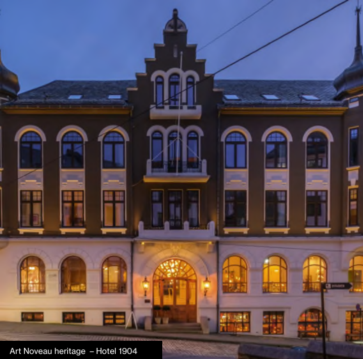
Art Nouveau heritage – Hotel 1904