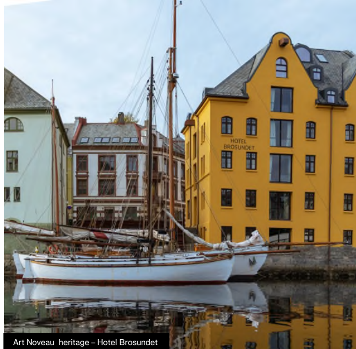
Art Nouveau heritage – Hotel Brosundet