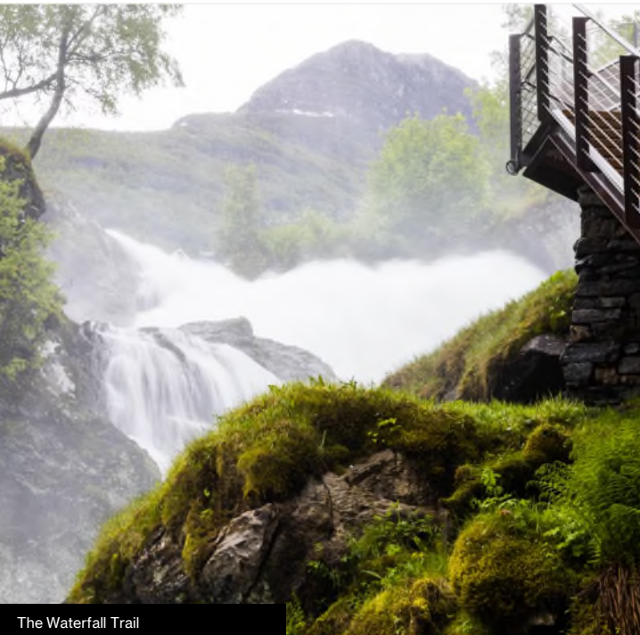
The Waterfall Trail