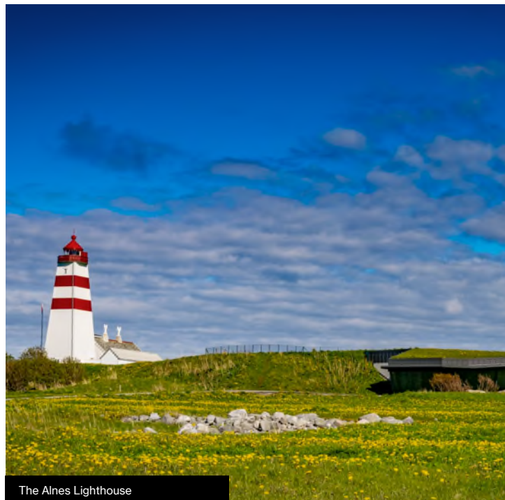
The Alnes Lighthouse