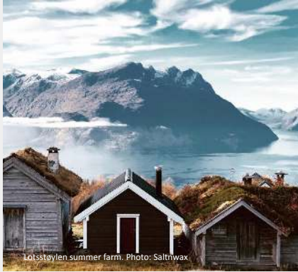
Løtsøylen summer farm.