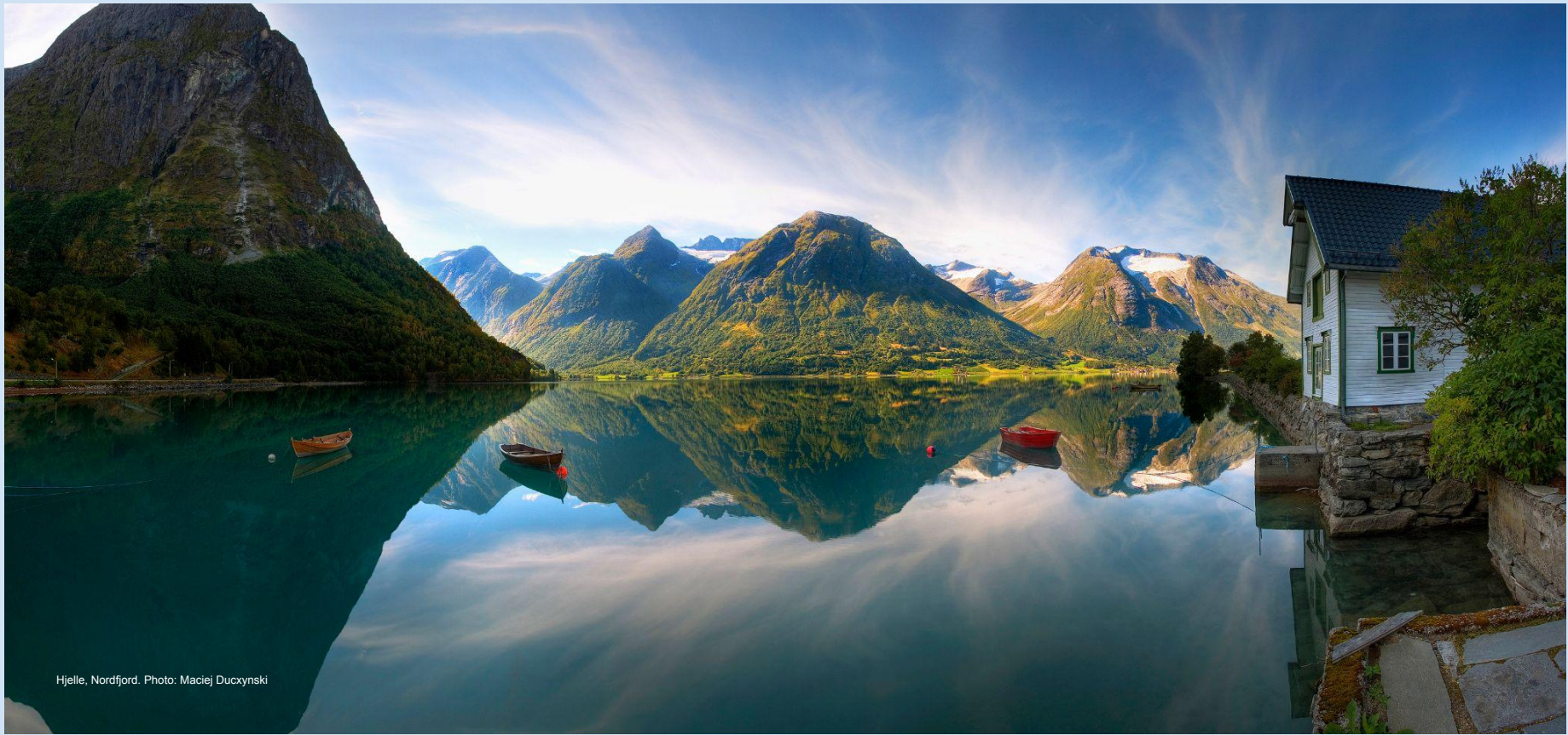
Hjelle, Nordfjord.