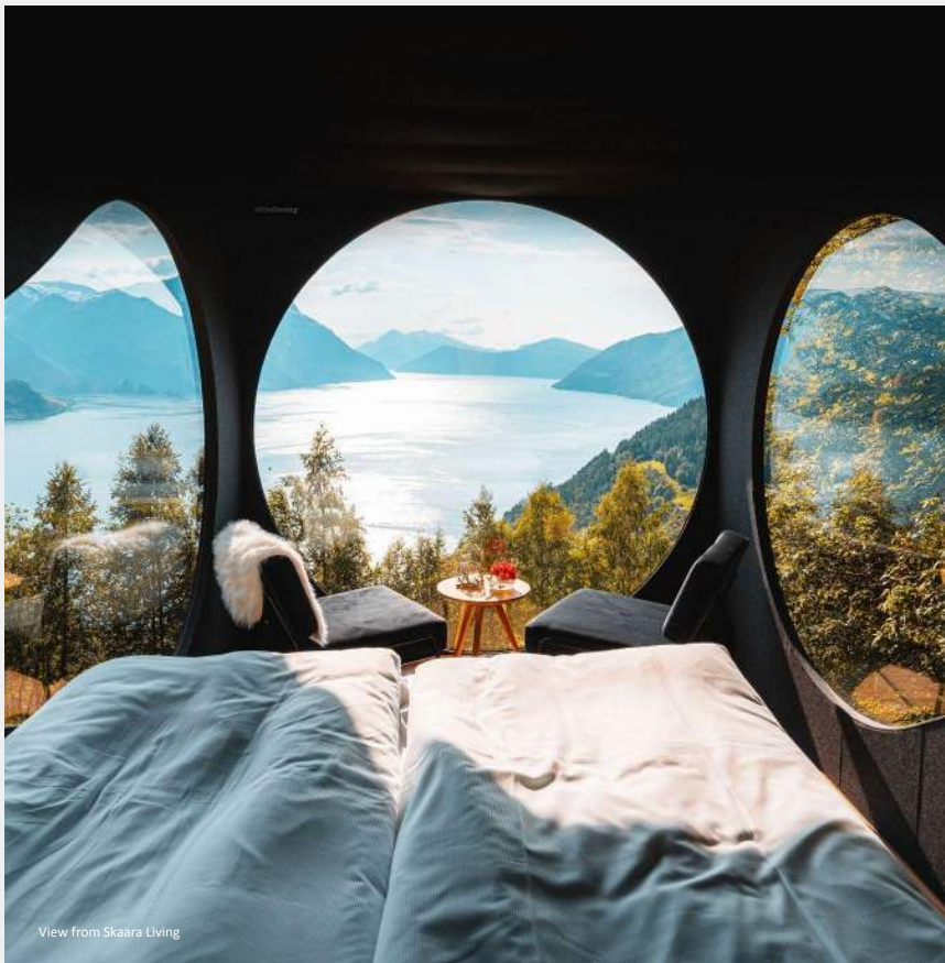
View from Skaara Living