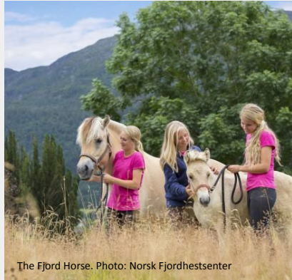
The Fjord Horse.