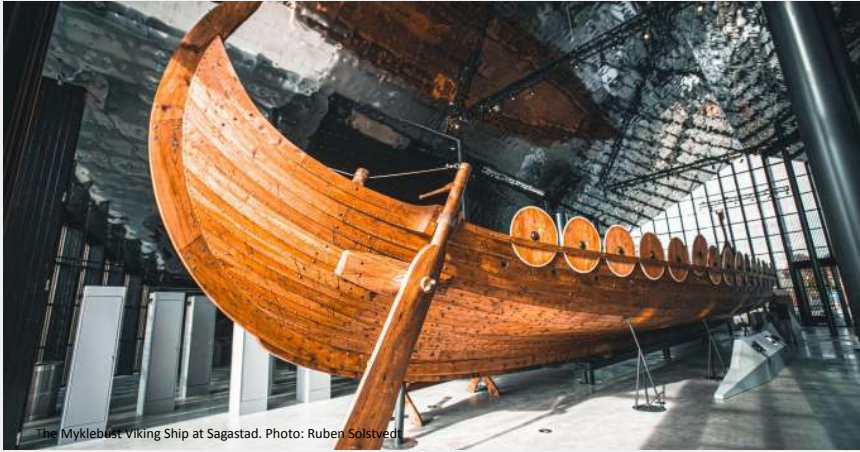
The Myklebust Viking Ship at Sagastad.