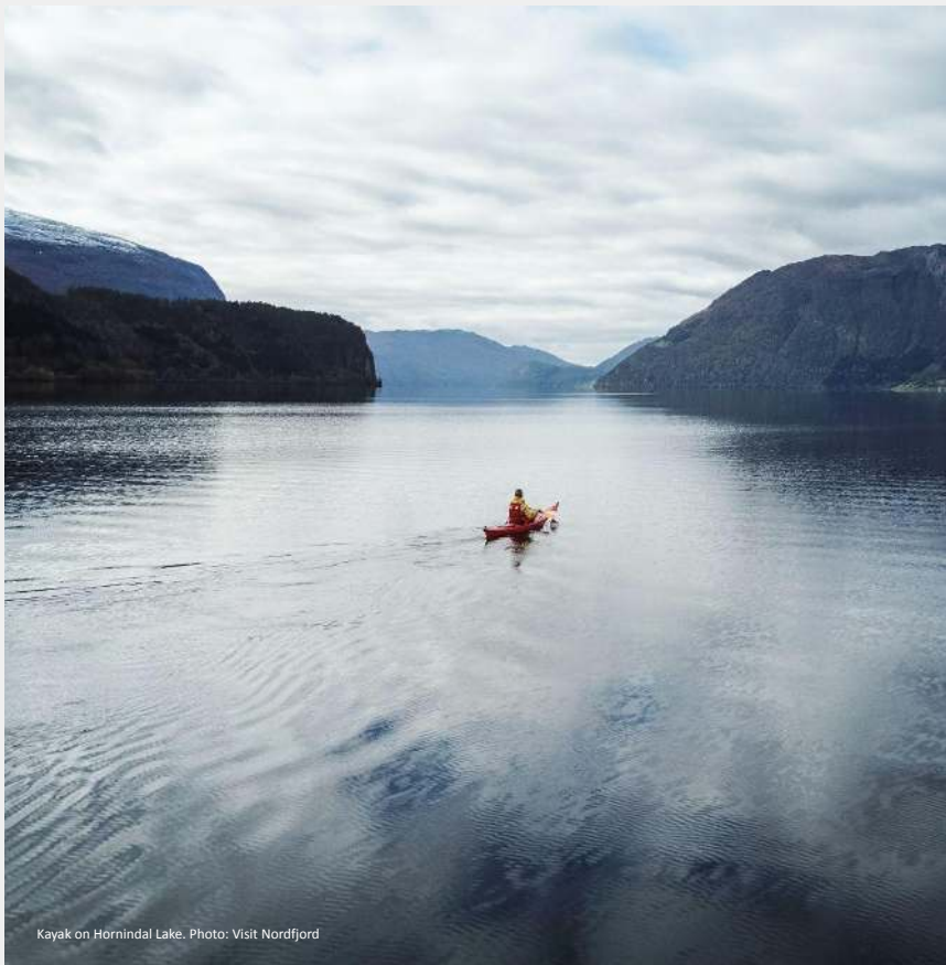
Kayak on Hornindal Lake.