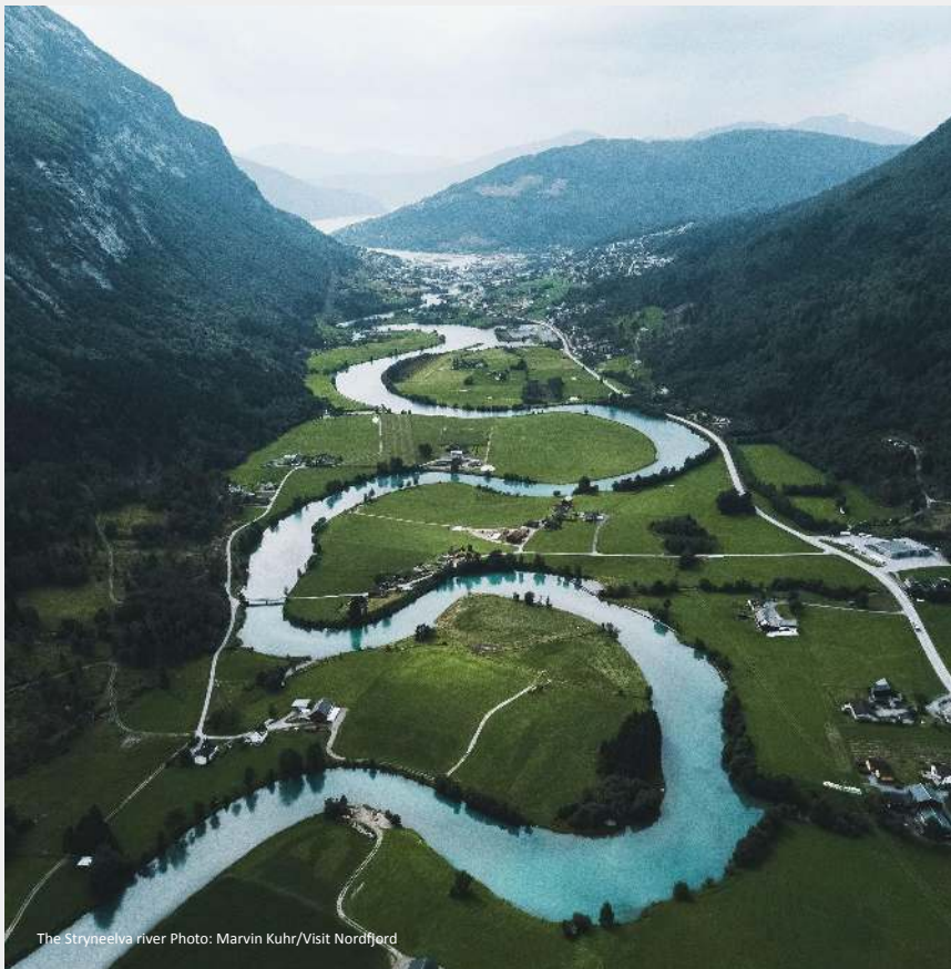
The Stryneelva river