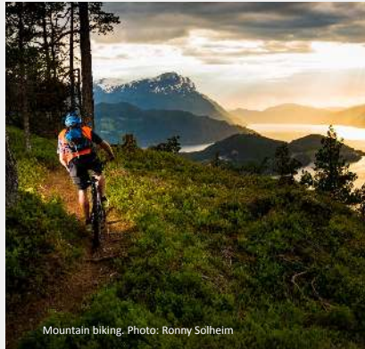
Mountain biking.