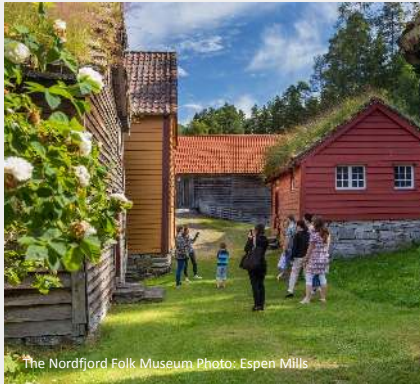
The Nordfjord Folk Museum