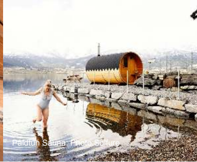
Faldtun Sauna.